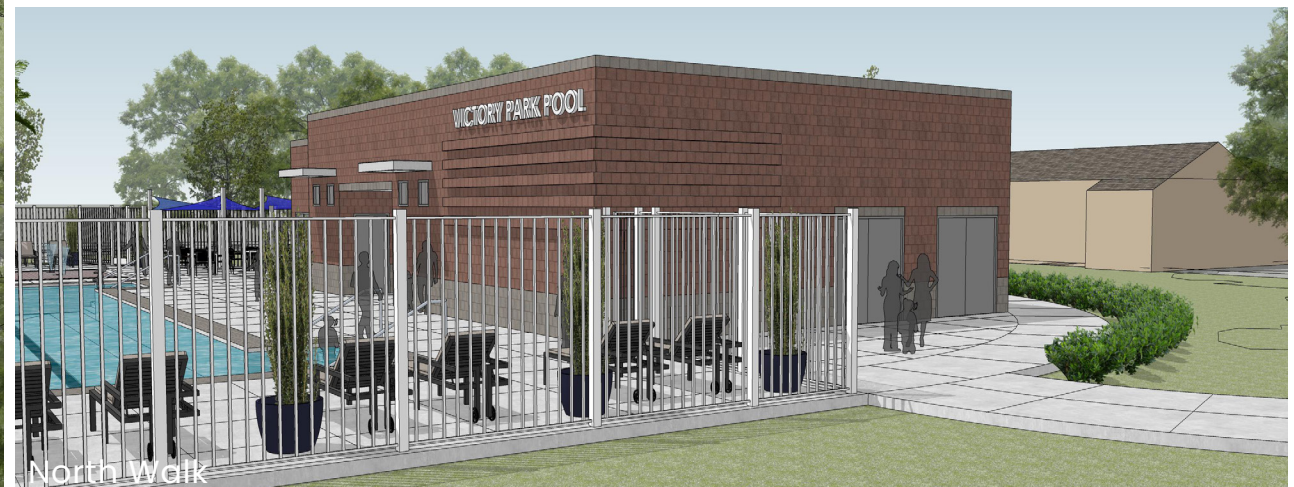
Final Concept 3D Views