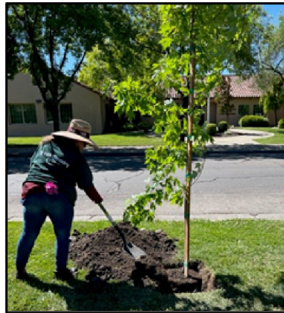
38 Trees Planted