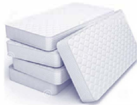
115 Mattresses/ Box Springs