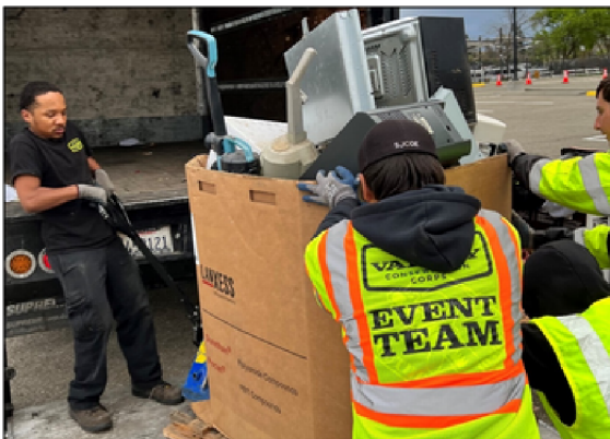
Above: San Joaquin Greater Valley Conservation Corps members load e-waste for recycling at the March 19 recycling event held at the Banner Island Ball Park.