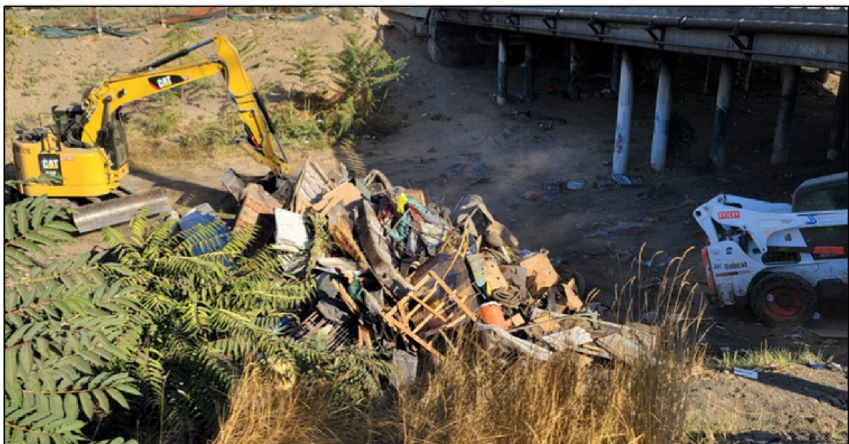
Above: The Police and Public Works Department are shown conducting a Homeless Encampment Cleanup event on October 29 at Mormon Slough.