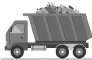
76.8 Tons of Trash

The Stockton Police Department's Neighborhood Services Section (NSS) worked with various communities to take proactive steps to improve quality of life by enforcing the removal of garbage and blight, working to reduce crime, and increasing the sense of safety. The Neighborhood Betterment Team (NBT) is a two per year, 90-day program that includes a large-scale neighborhood cleanup day. Similarly, Code Enforcement Sweeps focus on blight, have a shorter duration, and provide a neighborhood cleanup day. The Police Department, together with Waste Management and Republic Services, hosted 5 Neighborhood Cleanup events at various locations citywide with 682 vehicles served. The following shows the annual collected totals. Appendix C provides the detailed breakdown by event.