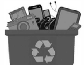
112 CEW / 44 CRT Electronic Waste