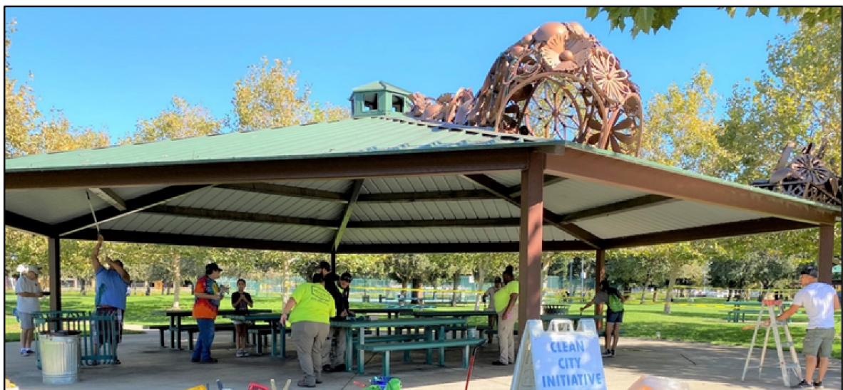
Above: Volunteers, San Joaquin Greater Valley Conservation Corps members, and City staff paint the picnic area at the Community Cleanup/Beautification event held on October 1 at Equinoa Park.