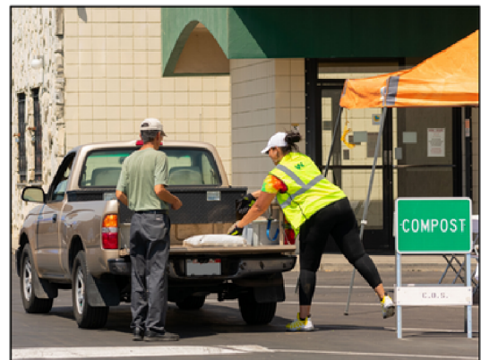
Bagged compost was a highly sought out commodity with 2,280 bags distributed over the 6 drive-thru recycling events.